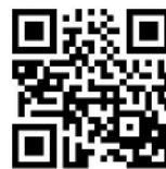
Braid-Reinforced Catheter Shaft Design