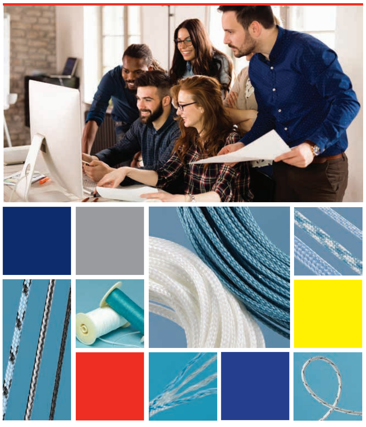
Work With The Suture Experts™